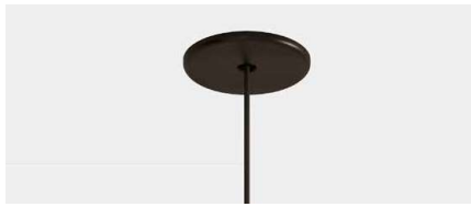
Remote installation with mini built-in ceiling rose Installation à distance avec monture mini encastré